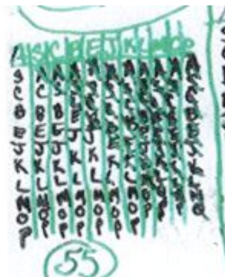
Figure 4 – Aiesha's move to property noticing

In this case, the students' questioning helped Aiesha to notice properties about her representations, thereby prompting her movement to the property noticing layer. This layer may be characterized as one in which the individual "...can manipulate or combine aspects of his/her images to construct context specific, relevant properties." (Pirie, & Kieren, 1994) In this case, Aiesha noticed that her picture representation had double the amount of handshakes, which prompted her to build on her older representation, thereby constructing a new chart (figure 4).