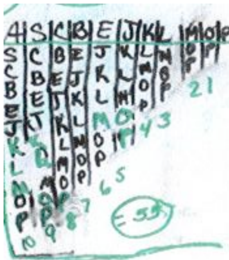
Figure 3 - Aiesha's chart for finding the number of handshakes when 11 people are at the party

Aiesha then begins drawing the chart in figure 3 and explains it to her peers.