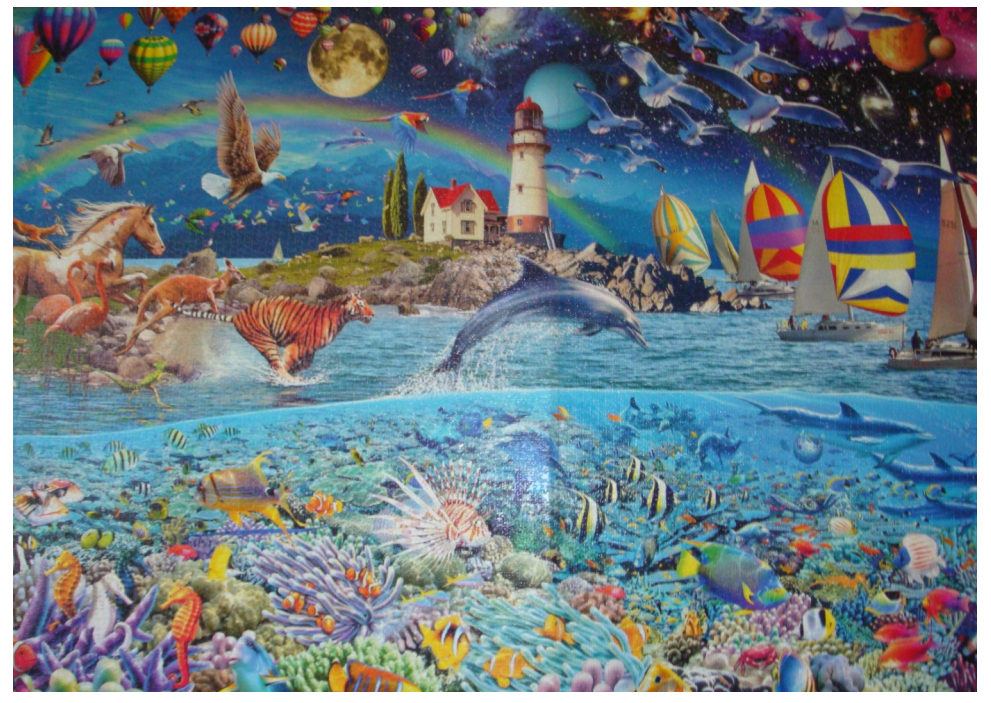
A detail of the puzzle, Life, the Great Challenge, in the Amy Job Classroom.

If you haven't yet seen the finished product, stop by the Amy Job Classroom and take a look. It is a welcomed addition to the wall at the