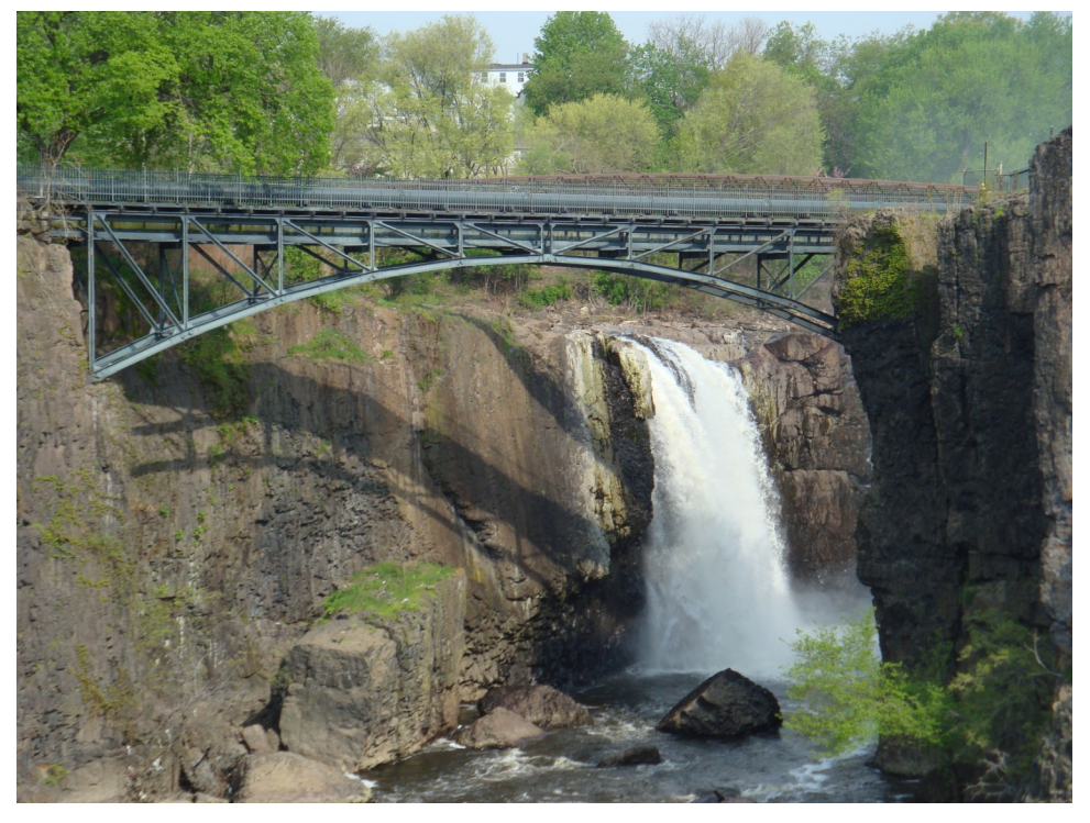
A recent photograph of the Great Falls of the Passaic River, Paterson, New Jersey.

As Mr. Zax noted, the City of Paterson enjoys the designation of having produced many of America's "firsts": the first hydropower system, the first motorized submarines, the first sail cloth, the first Colt revolvers, and the first American silk fabric production.