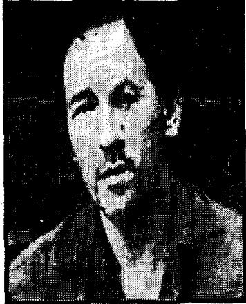
Bruce Springsteen and the E-Street Band released their first album since the late 80's.

Springsteen obviously wanted to give his fans a memorable evening with a set list of 24 songs that included old favorites from his first two albums rarely heard in