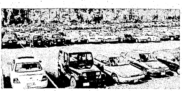
Pioneer Photo by Matt DeFranza

"There are never enough See PARKING, Page 6