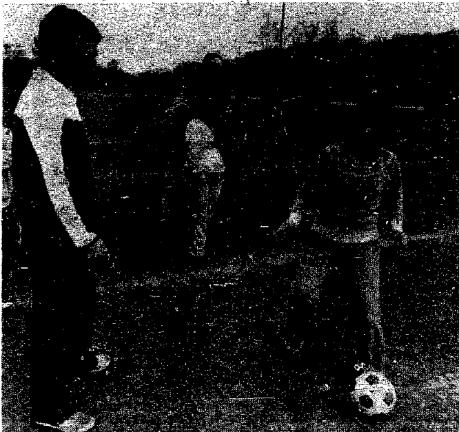
Beacon Photo by Frans Jurgens

In the Special Olympics it is not speed, strength or agility that wins. The mentally retarded "Special Olympians" are not always skillful in these ways. More important than winning is their courage to try.