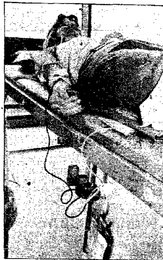
One of the many donors at the 20th annual Eric Hummel Blood Drive makes her one-pint donation.