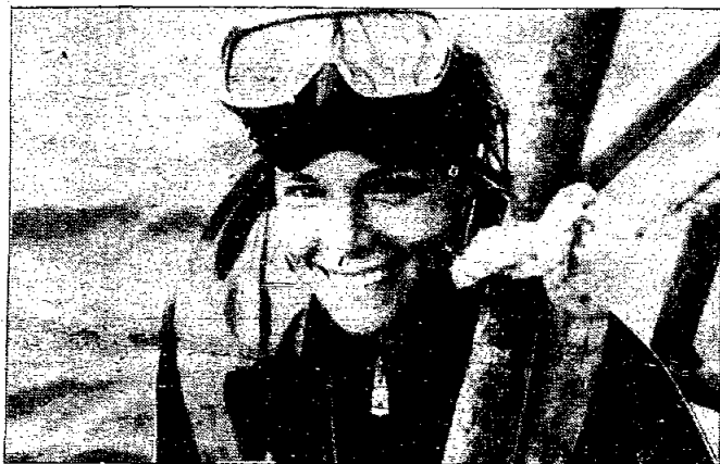
Sylvia Earle, marine biologist.

A research associate for the University of California at Berkeley, Earle is very concerned with the endangered whales. She recently spent months researching humpback whales.