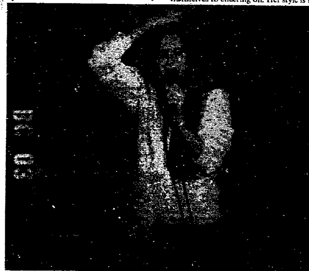
Beacon Photo by Jerry Diaz

Sign-up & Specifics - Student Activities office - SC-214 595-2518