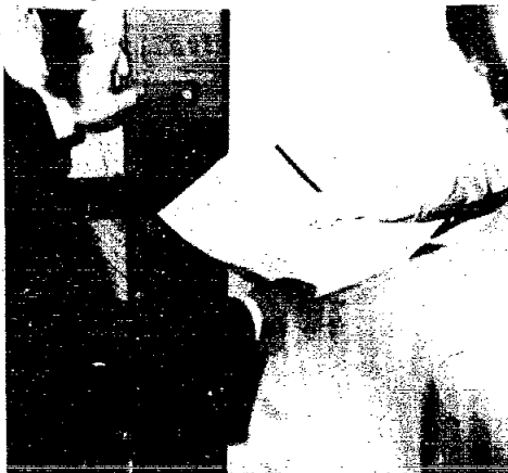
A list of demands exchange hands at a past meeting of the Board of Trustees and ACS-COTAB.

As the week goes on the efforts should become more tangible as to what the student will do, with he or she having the final decision.