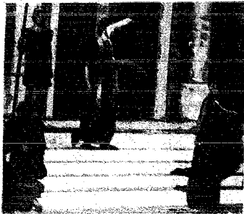
A scene from Medea, an outstanding production performed by Pioneer Players.

Respectfully submitted, Randy Vander Weit