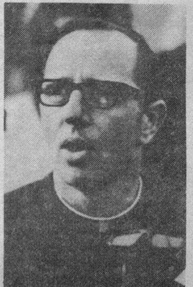
FATHER JAMES GROPPi