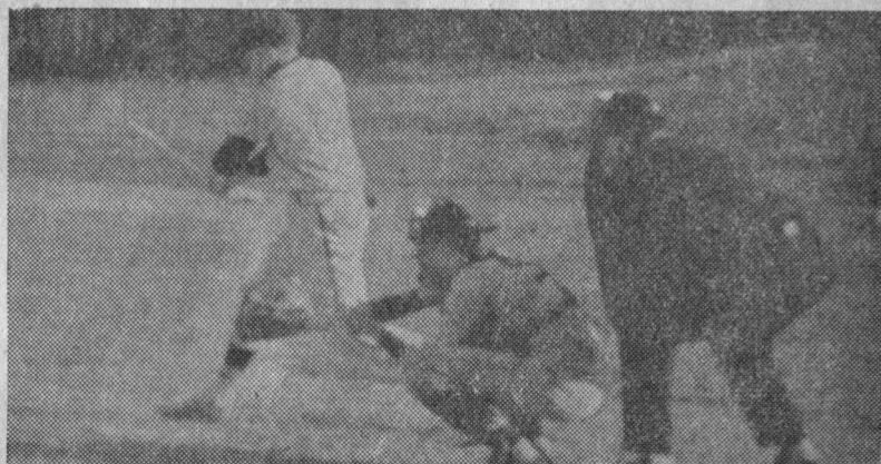
PATERSON STATE BALL PLAYER swats out a single down the right field line at the Pioneer-Trenton game held last Friday. The PSC nine were defeated by a 6-2 score.