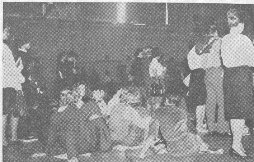
PLANNING? Approximately 150 students viewed Ferrante and Teicher from a standing position, while others were content to just listen. How many more students would have been unseated if the K-P and G-E Juniors were on campus? or was that taken into consideration before the scheduling of the program?