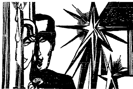
"Spirit of Christmas"