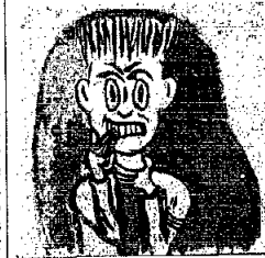
I: this how you look before exams?